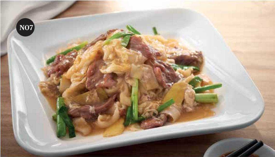
Beef Char Kway Teow