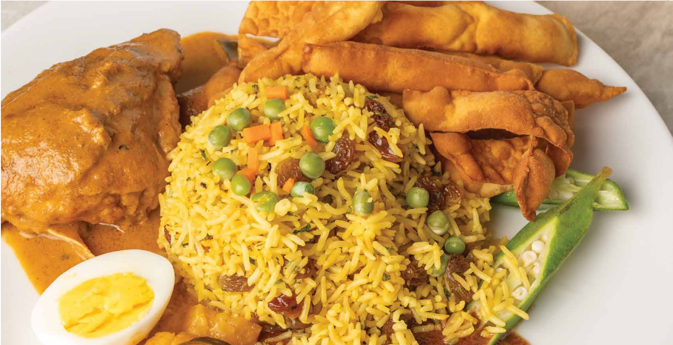
Aromatic kunyit (turmeric) basmati rice served with curry potato, hard boiled egg, ladies finger, papadum and sambal with a choice of PappaRich's signature fried chicken, aromatic beef rendang, sweet & spicy squid or curry chicken.