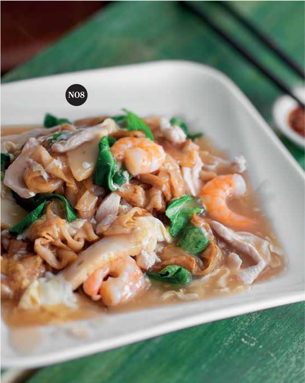
Wat Tan Hor