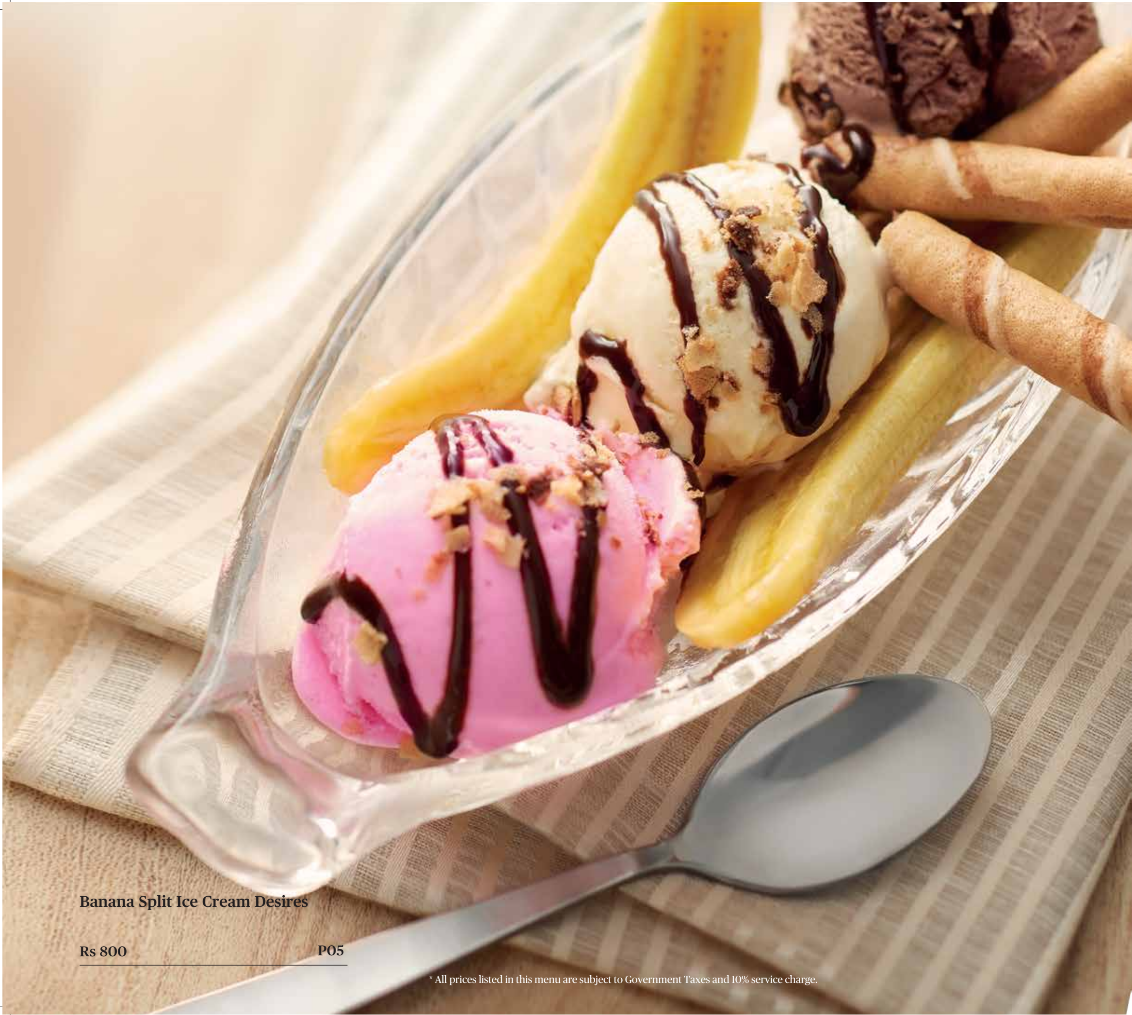
Banana Split Ice Cream Desires