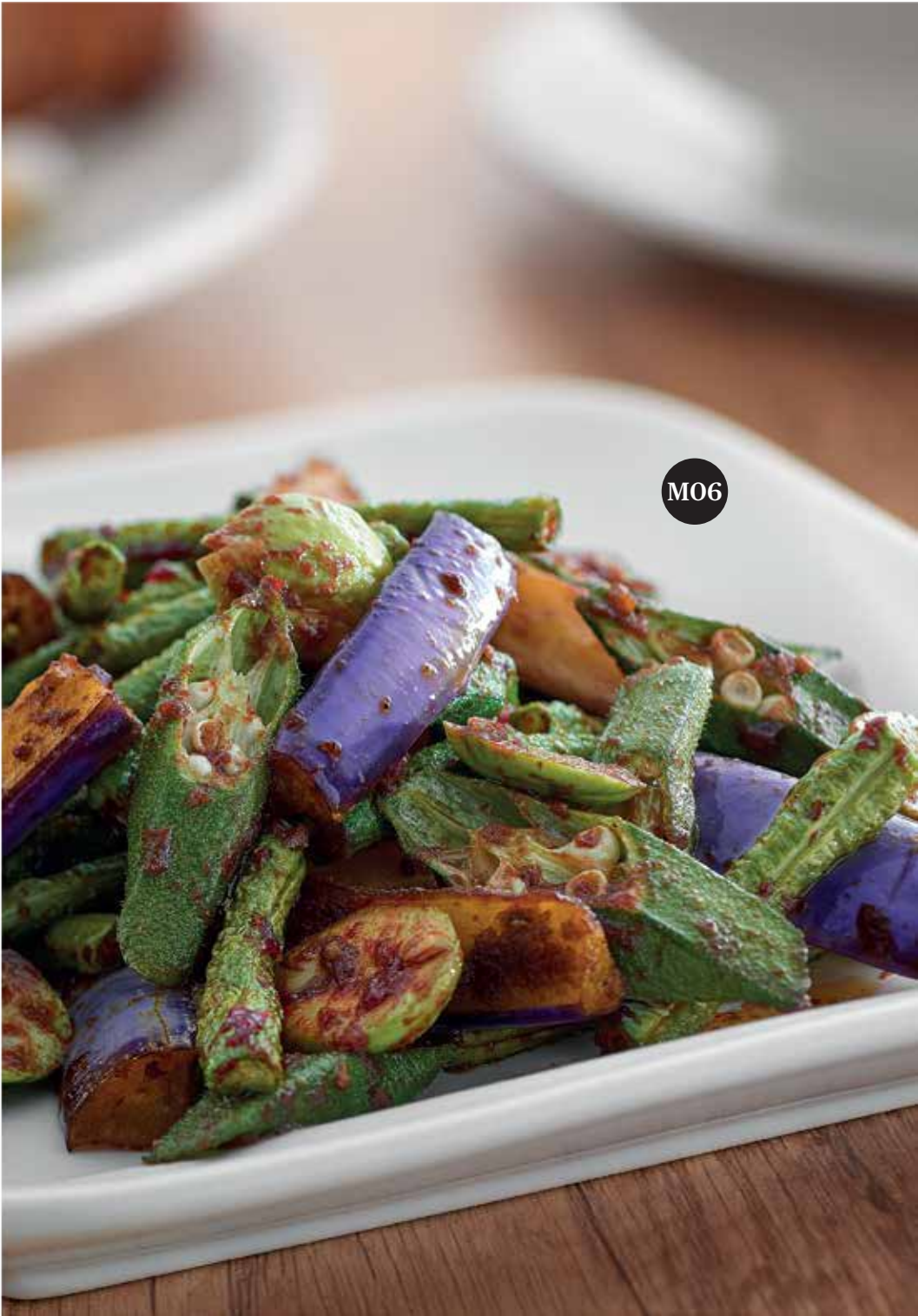
Four Heavenly Kings