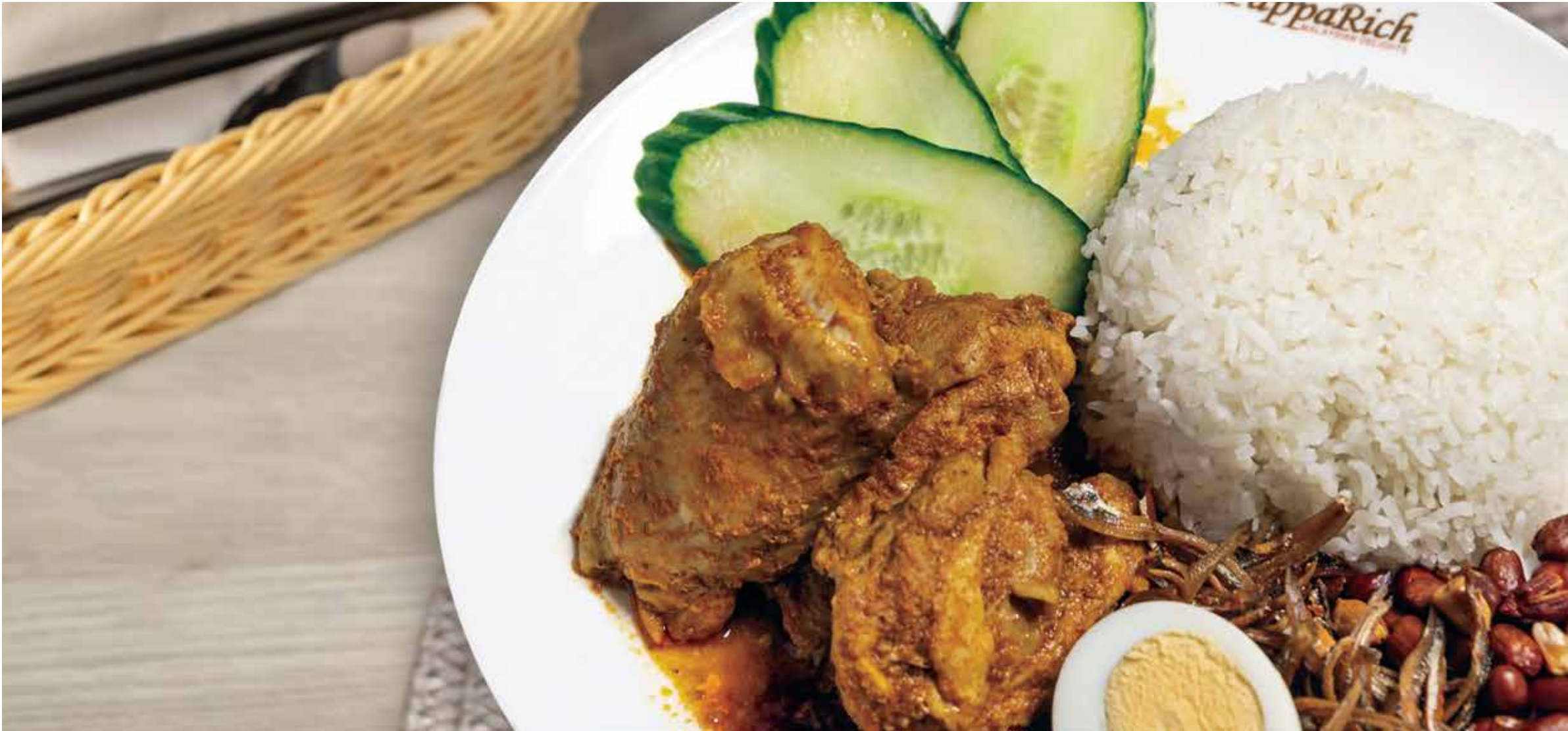
Coconut milk infused steamed rice served with a choice of either fried chicken leg , curry chicken, boiled egg, beef rendang with fried anchovies and peanuts and sliced cucumber.