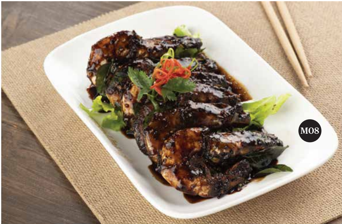
Large Black Pepper Prawns (6 pieces)