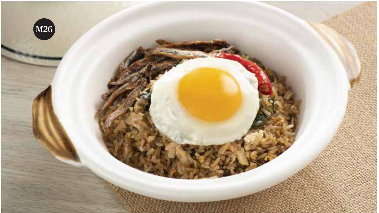
Kampung Fried Rice