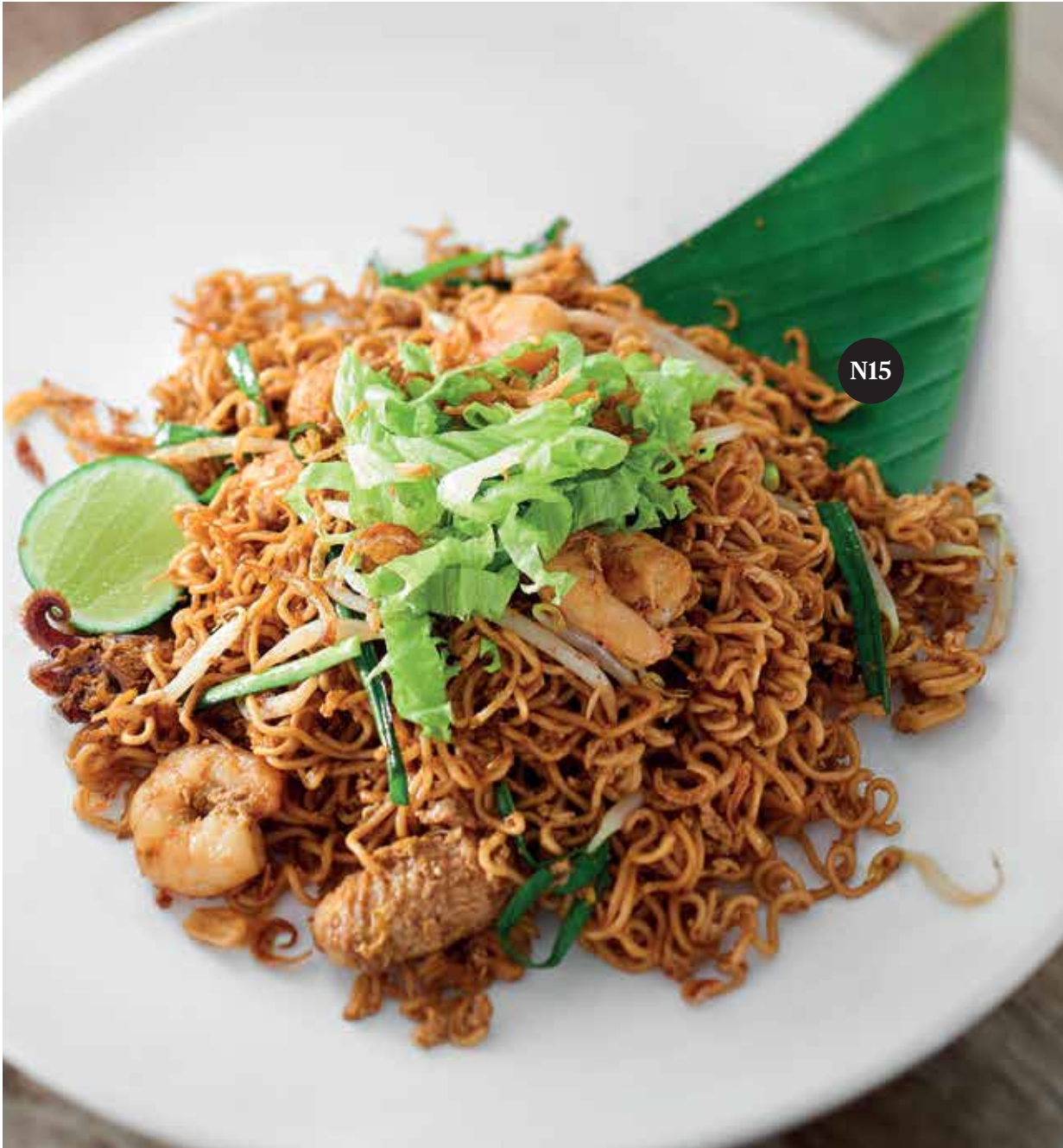
Wok-Fried Springy Noodles