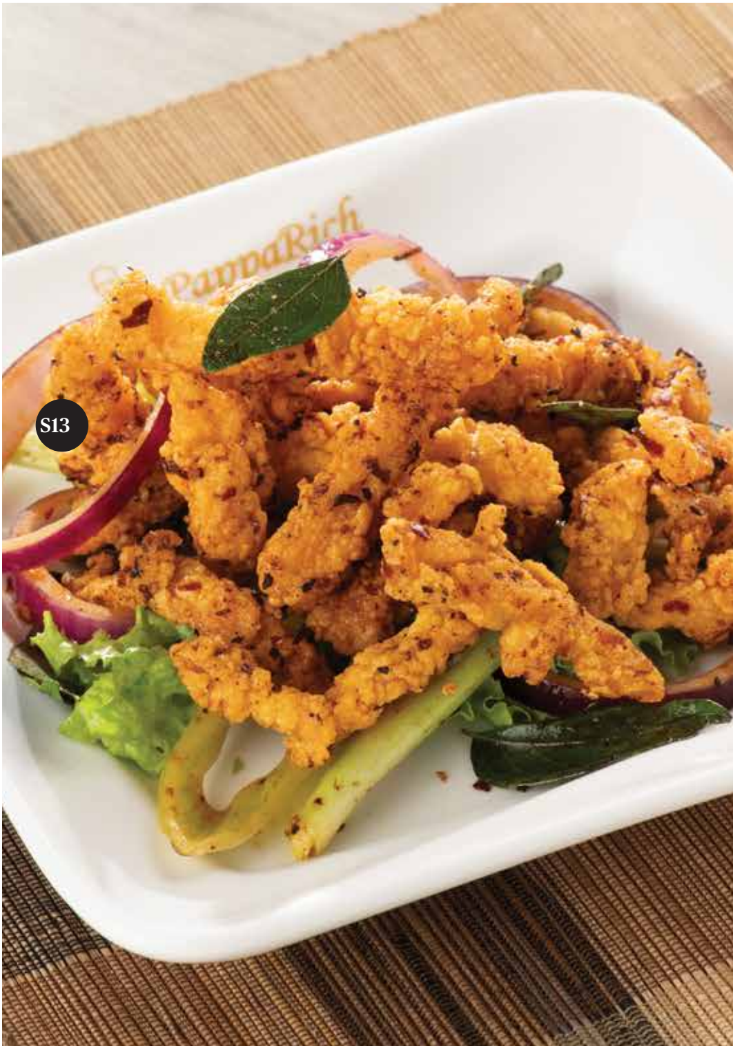
Hot Butter Mushroom