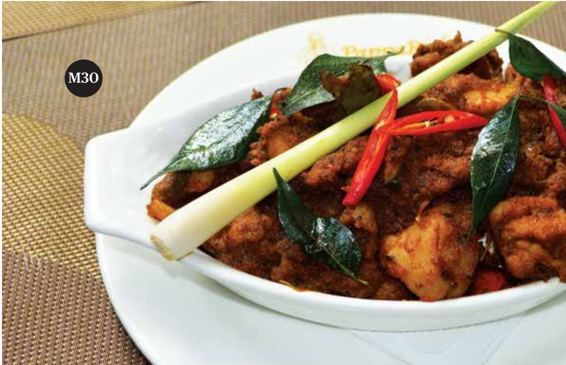
Claypot Chicken with Shiitake Mushroom