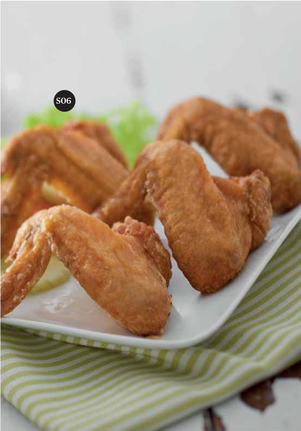
Fried Chicken Wings (4 pieces)