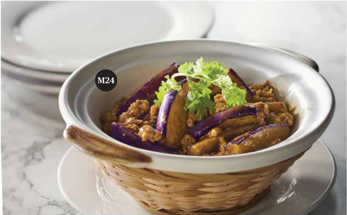
Claypot Eggplant With Minced Chicken