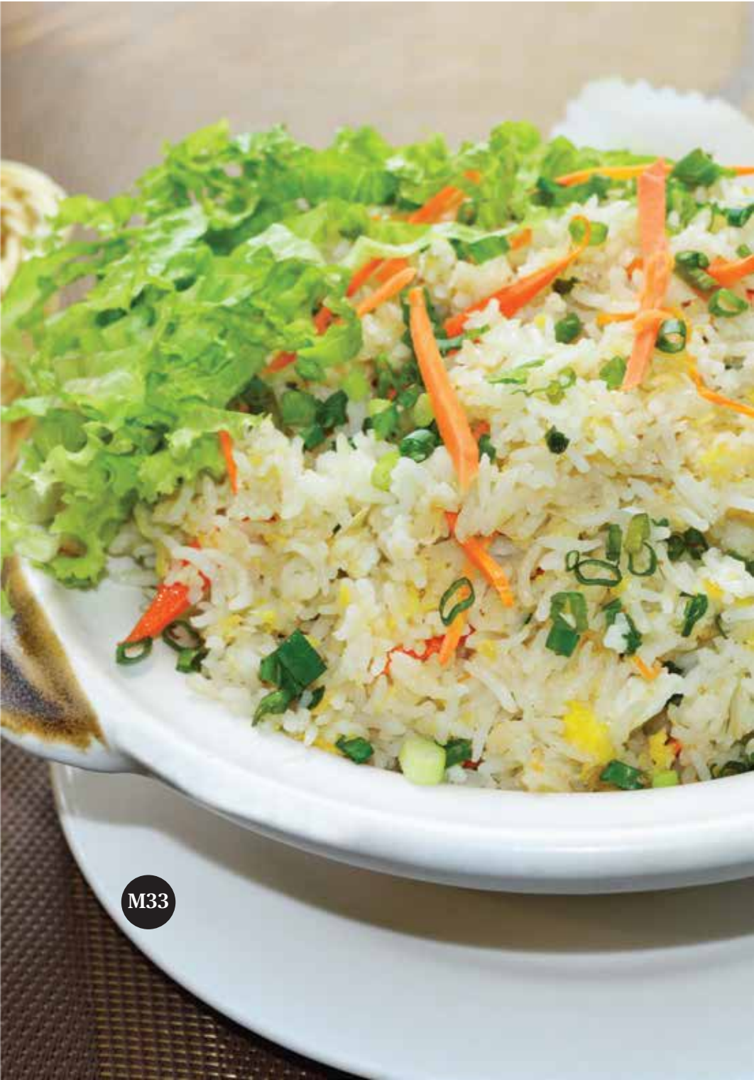
Egg Fried Rice