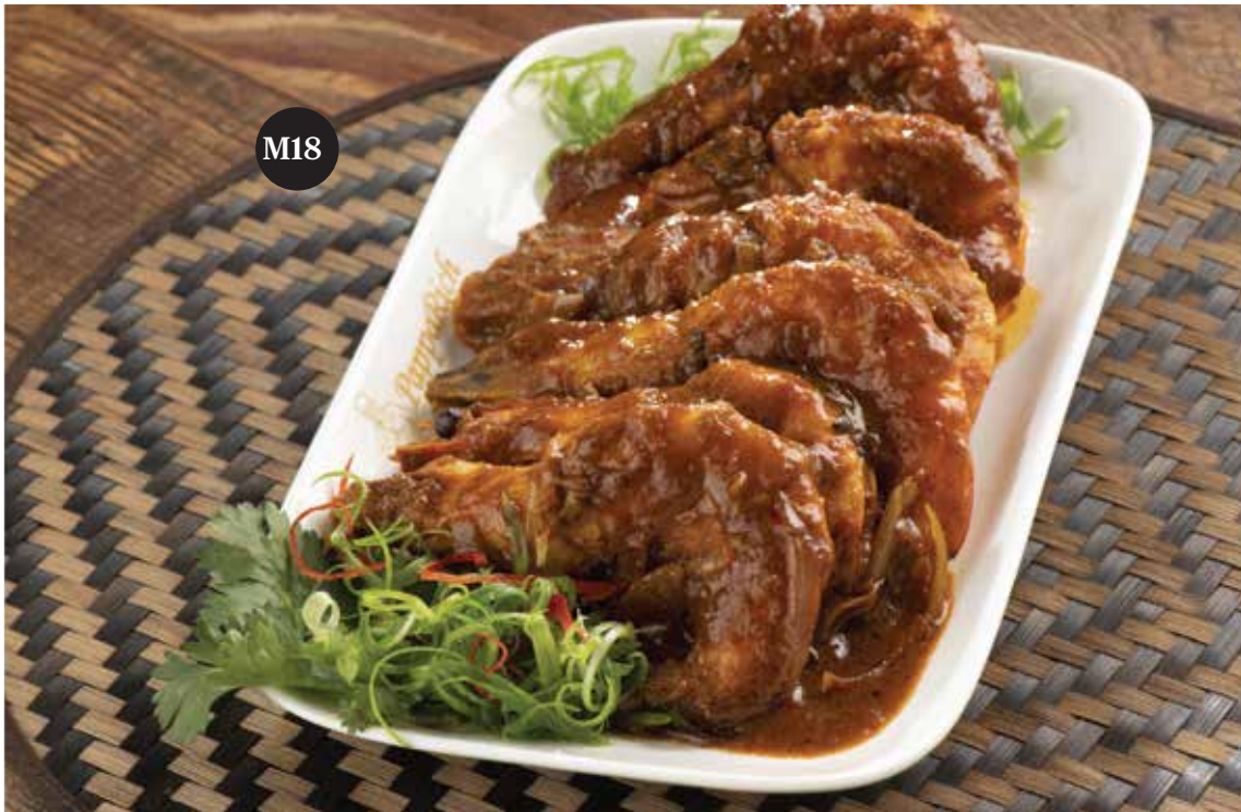
Medium Black Pepper Prawns (10 pieces)