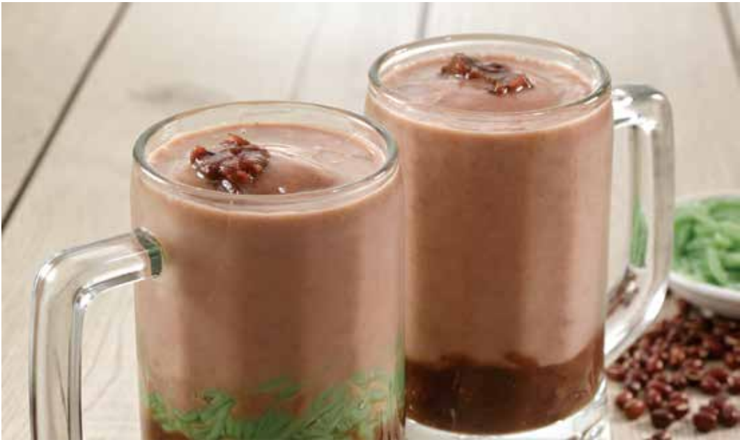
3 Layer Tea (Iced)