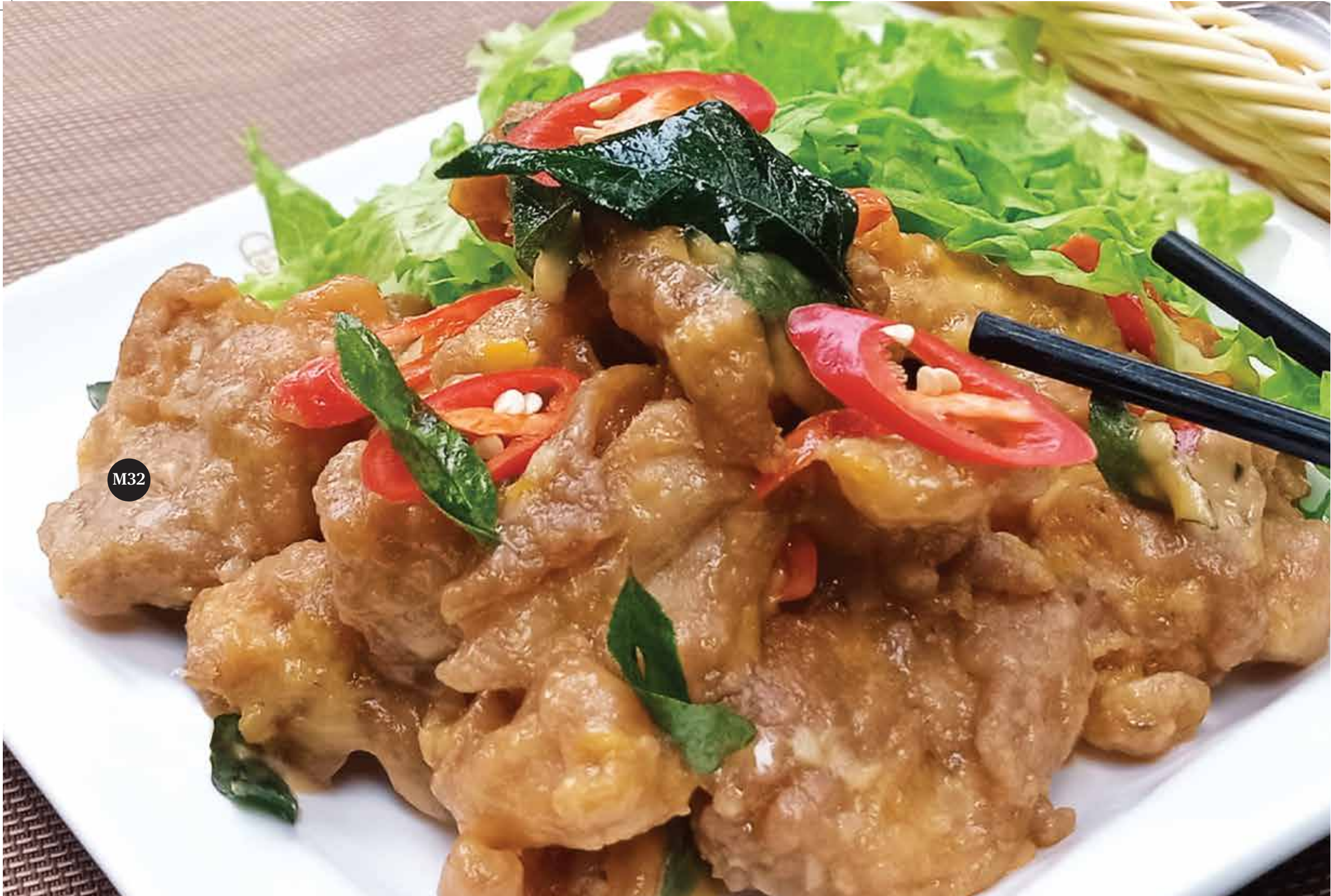
Chinese Style Butter Chicken